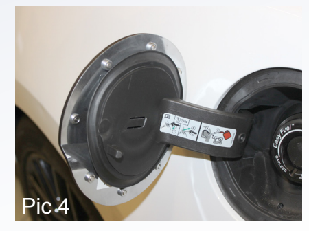
Drake Muscle Cars

130 Cassia Way, Henderson, NV 89014 Tel: (702) 853-2060 www.DrakeMuscleCars.com