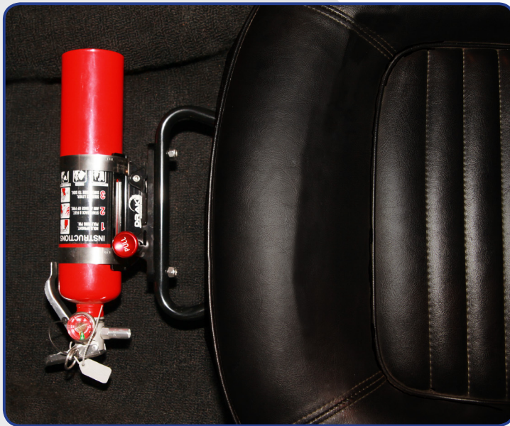
Completed Installation of Scott Drakes 1965-68 Mustang Fire Extinguisher Mount Bracket