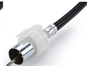
Ford Clip On Cable 130050-36 ECD-200BT-5