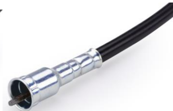
GM Clip On Cable 130049-36 ECD-200BT-2