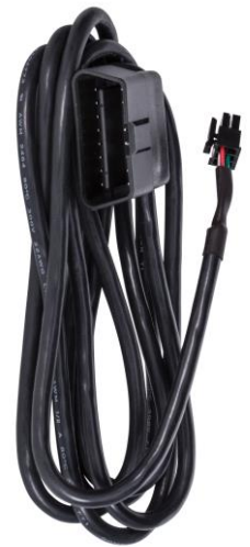
OBDII Adapter Harness - 130063