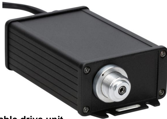
Cable drive unit