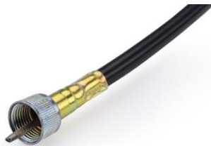
GM Thread On Cable 5/8" - 130048-36 ECD-200BT-1